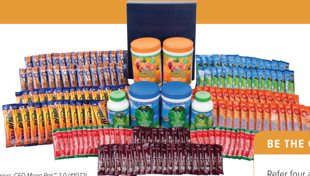
Shown above: CEO Mega Pak™ 2.0 (#1072)

If you're serious about promoting the Healthy Body Challenge or any of Youngevity's signature product lines, the CEO Mega Pak opens doors to additional compensation and recognition. It gives you everything you need to get off to a fast start! This "business in a box" contains over $500 worth of Youngevity's most popular products plus Youngevity's proven business building system.