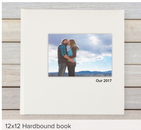
12x12 Hardbound book