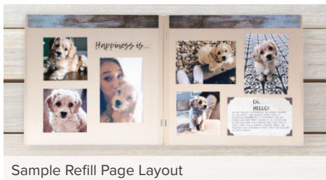
Sample Refill Page Layout